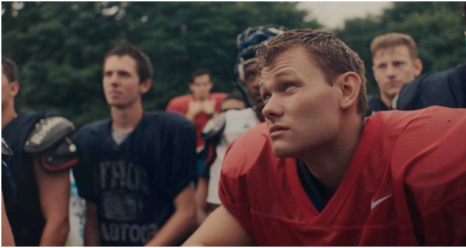
A production still from “Monkey” by Troy Lustick