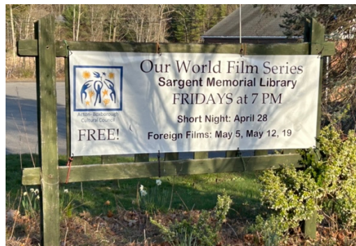
Boxborough Banner (hung between Boxborough Fire and Police Stations)