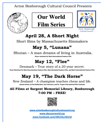
2023 ABCC Our World Flyer (posted at area businesses)