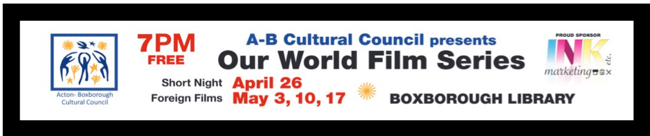
Acton Banner (hung over Main Street/Route 27)