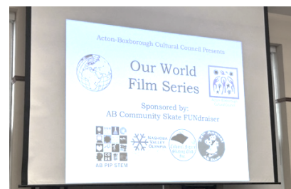
Short Night Sponsor Slide (shown before each screening)